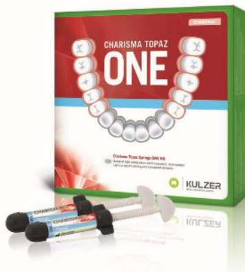
Charisma Topaz ONE KIT

Charisma Topaz ONE Shade for basic restorations, e. g. in the posterior region. All known Charisma Topaz shades for more complex and aesthetically challenging cases, e.g. in the anterior region.