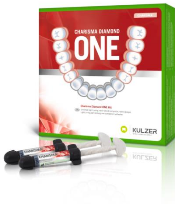
Charisma Diamond ONE KIT

Charisma Diamond ONE Shade for basic restorations, e. g. in the posterior region. All known Charisma Diamond shades for more complex and aesthetically challenging cases, e.g. in the anterior region.